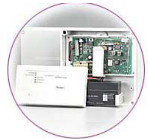
Need more range to reach multi-story buildings or across a campus? Add a repeater. Shown here with optional enclosure.