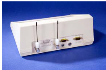
MicroVision 300 Wireless Emergency Call System Console. Rear view with antenna and connectors for optional paging.