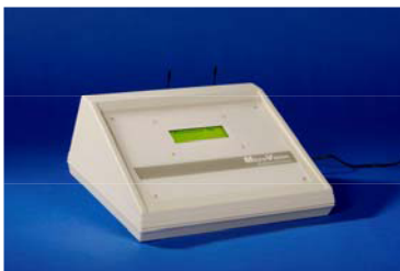
MicroVision 300 Wireless Emergency Call System Console. Front view showing 16 character alpha-numeric display.