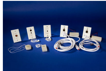
Select from a variety of stations including pendant style transmitters, emergency pull stations, bed stations, door/window exit alarms, smoke detectors, etc.